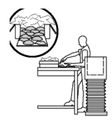
Figure 12 - Cutting one wall of the box eliminates bending the wrist

To reduce bending, place the packaged meat on a lifting table on wheels. Lift tables can be raised and lowered pneumatically with a pump powered by battery or electricity or a pump operated by hand or foot. To reduce twisting, make sure that the lifting table is beside and not behind the worker. The use of a sit/stand stool should be considered for the packaging operation. Workers should use gloves because of the low temperatures. Workers should also use anti-fatigue matting to reduce stress on the legs and back due to prolonged standing on a hard floor.